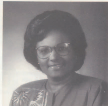
BILLIE MILLER DEPUTY LEADER OF THE BLP YOUR CANDIDATE for THE CITY OF BRIDGETOWN