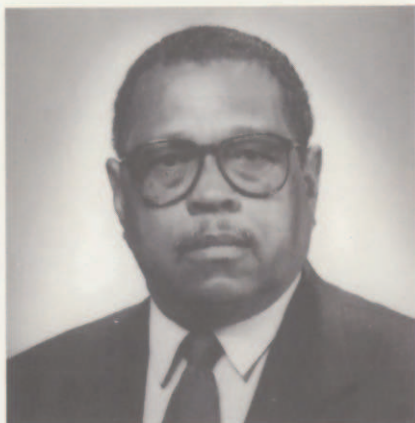
BERNARD ST. JOHN FORMER PRIME MINISTER YOUR CANDIDATE for CHRIST CHURCH SOUTH