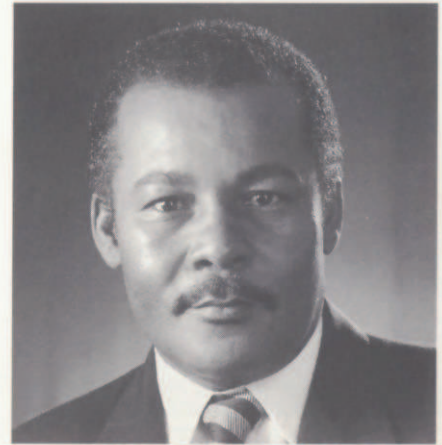
OWEN ARTHUR Leader of the BLP Your Candidate for St. Peter