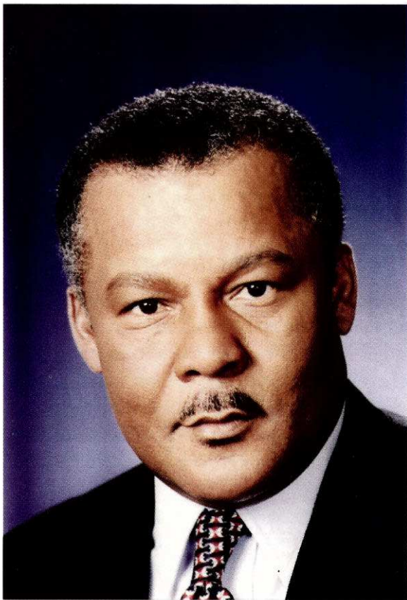
OWEN ARTHUR LEADER THE BARBADOS LABOUR PARTY

We have provided the leadership that the Barbadian people so devoutly wish to always be the hallmark of the Barbadian way of doing things.