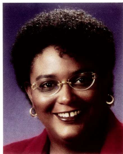
Mia Amor Mottley St. Michael Northeast