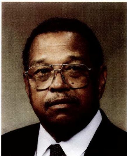
Sir Harold St. John Christ Church South