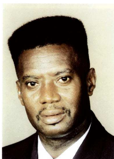
Gray Brome St. Lucy